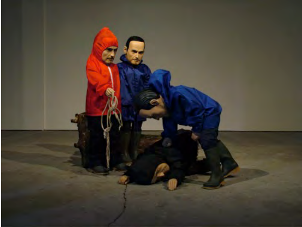
Everything's Mad, 2014

“Everything is mad” shows three figures attacking a fourth. The work was inspired by images from 1970s children’s television and Isis hostage snapshots. The piece is intended to be equally naive and sinister: is this children playing, mimicking the actions of adults, or adults being carried away with an immature enthusiasm for collective violence?