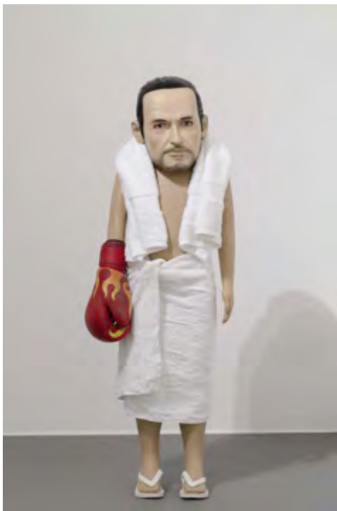
“The Overman”, 2012.